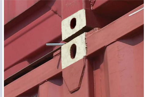
No hidden handle on 102" wide containers!

Securing Your Containers. Protecting Your Cargo. At Sea. Over Land. On Rail.™