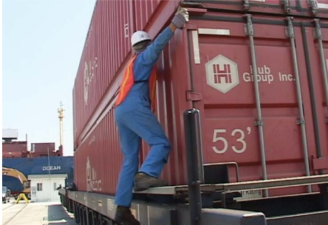
Prevent fall by locking & unlocking from the ground with a pole.

The 6601-6961-L design is a result of many years of studying typical damages to rail IBCs. We'd like to point out the following facts that make this IBC the leading industry choice: